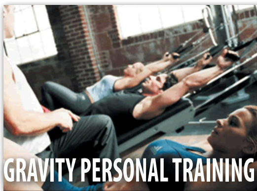
GRAVITY PERSONAL TRAINING